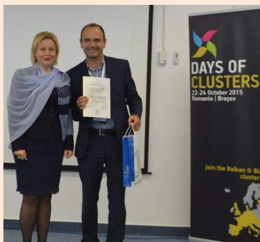
The University of Transilvania