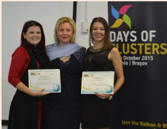
The ALT Brasov Cluster (Andra – Medeea)