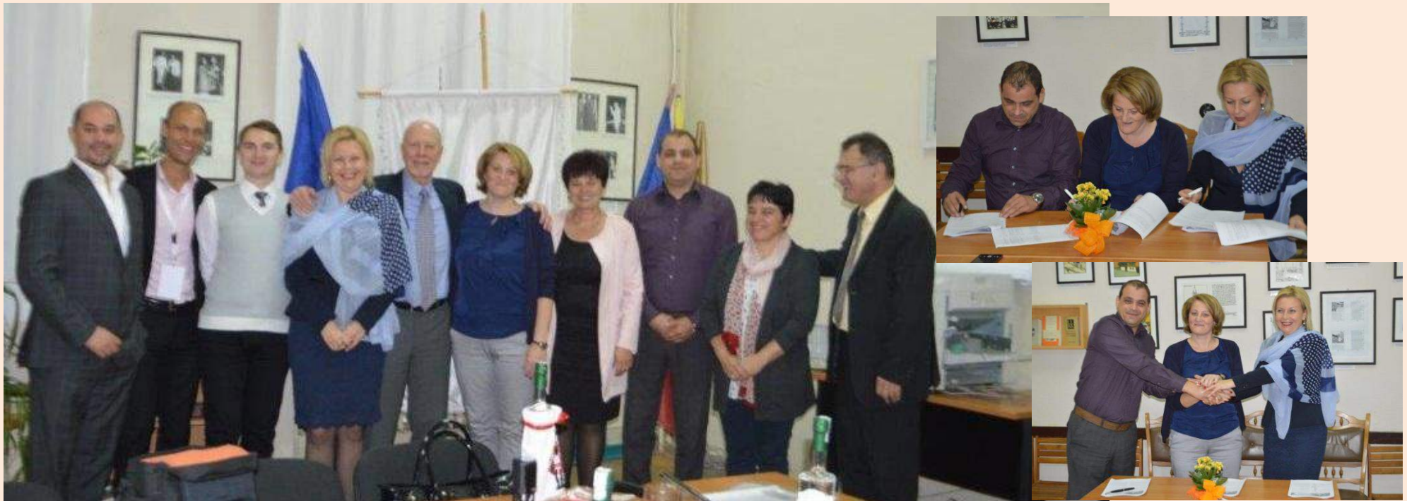
Sfantu Gheorghe, Romania

The Transylvania Textile & Fashion cluster and the Kos Karoly Professional School, The Association of the Small and Medium Enterprises in Covasna County (ASIMCOV), BUSINESS INCUBATOR of SFÎNTU GHEORGHE