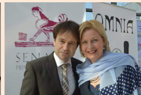
D & D